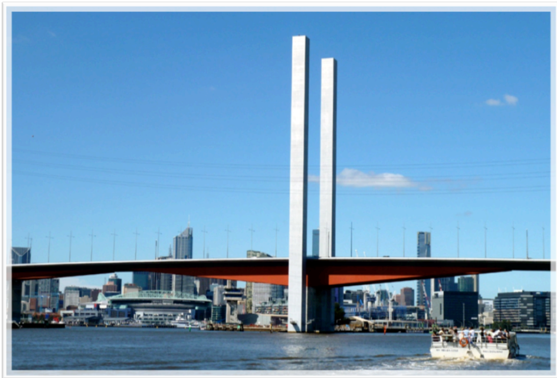
The Bolte Bridge - Melbourne's Biggest Tuning Fork Bridge