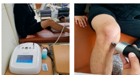
Figure 2. Vibroacoustic intervention applied on an anterior cruciate ligament reconstruction.

Note: RPE, ratings of perceived exertion or Borg scale.