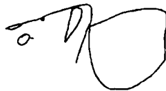
Illustration copyright Ursula Bellugi, The Salk Institute for Biological Studies, reprinted by permission.